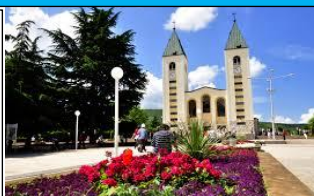
St James Church