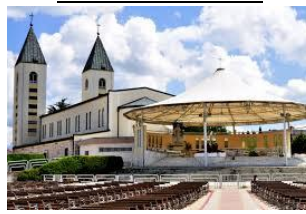
Blue Cross Apparition Site