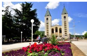
St James Church