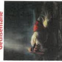
HOLY HOUR Gethsemane

Saturday 2 nd November – In response to the apparitions of Fatima , we will have Marian devotions each First Saturday. There will be Exposition of the Blessed Sacrament immediately after 10am Mass followed by Benediction. Then tea / coffee in Our Lady's Hall.